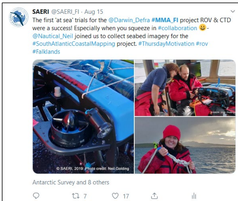
Figure 1. Example of a twitter communication from this DPLUS071 project.

New information and material (e.g. reports, presentations, etc.) have regularly been added to the webpage during the past six months. In addition, project updates have been frequently posted on twitter and Facebook (i.e. a total of 11 communications in the last semester between the two platforms).